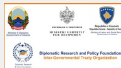
Diplomatic Research and Policy Foundation (DRPF)